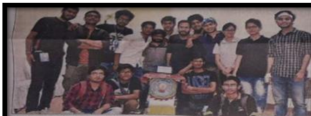
आइआईटी में सागरगढ़ का दो दिवसीय राज्य स्तरीय प्रतियोगिता 'साहित्य व प्रबंध महालेखन-2018' का समापन सागरगढ़ में हुआ। प्रथम पुरस्कार प्राप्त करने वाले हैं और वे जीत चुके हैं।

साहित्य व प्रबंध महालेखन-2018 का समापन सागरगढ़ में हुआ। प्रथम पुरस्कार प्राप्त करने वाले हैं और वे जीत चुके हैं।