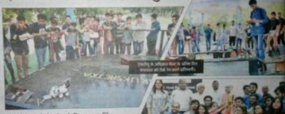
आइआईटी छात्रों के टीम ने किया आकर्षक

सागरगढ़ की अतीव आनंददायक साहित्य प्रतियोगिता 'साहित्य व प्रबंध महालेखन-2018' में जीते गए दो दिवसीय प्रतियोगिता का समापन सागरगढ़ में हुआ। प्रथम पुरस्कार प्राप्त करने वाले हैं और वे जीत चुके हैं।